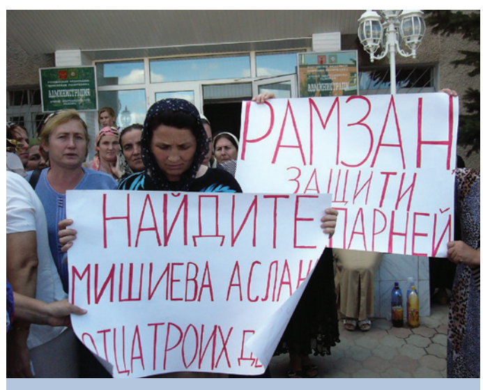
A demonstration for disappeared and killed relatives. Chechnya 2007.

Effective implementation of ECtHR judgments in our cases is a crucial element in bringing about systemic changes to Russia legislation and law-enforcement practice that will have a lasting effect on the human rights situation in the North Caucasus. At the same time, this is perhaps one of the most challenging aspects of our work. In order to target deficiencies in Russian law-enforcement we develop recommendations for individual and general measures in relation to each judgment. We also cooperate closely with other national and international non-governmental organizations in putting additional pressure on the Russian government to implement both general and individual measures. With more and more judgments being handed down by the Court we will in 2009 devote significant resources to this fundamental aspect of our work.