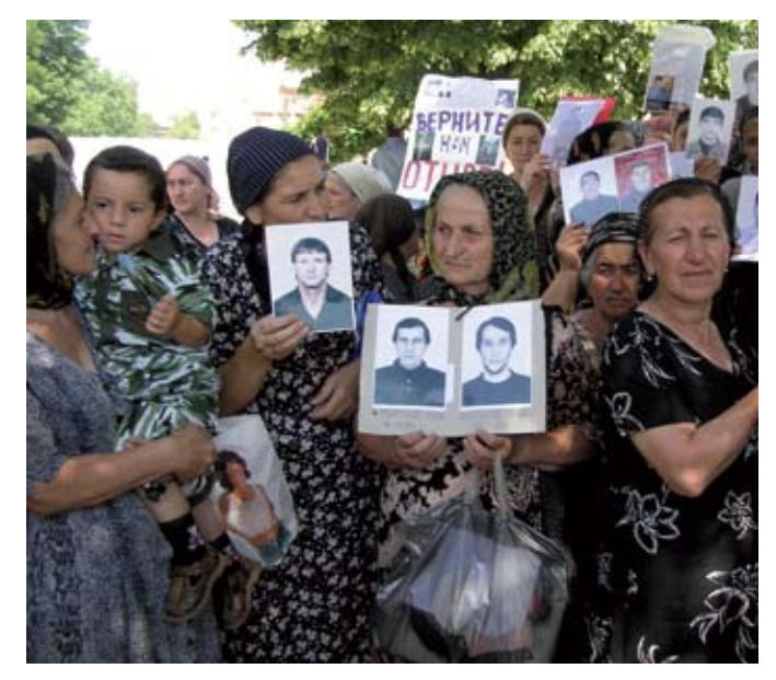
Relatives of disappeared men in Chechnya call for their return.

The current pattern of human rights abuses in the North Caucasus highlights the importance to continue litigation in a strategic manner, aiming to assist the most vulnerable populations. In 2011 we will therefore continue to examine and re-evaluate our legal priorities and strategies in order to ensure that we address the problem of impunity in the North Caucasus in the most effective manner.