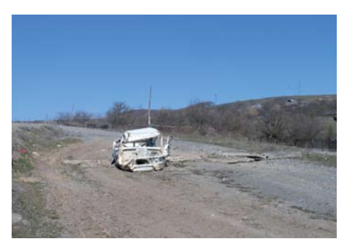
A burnt car on the Zarskaya Road leading out of South Ossetia into North Ossetia, on which many civilians were killed while trying to escape the shelling of Tskhinvali.

We also expect to strengthen the capacity-building aspect of the project in both Georgia and South Ossetia for civil society actors who are involved in local or international litigation, and for regional law enforcement and other state officials.